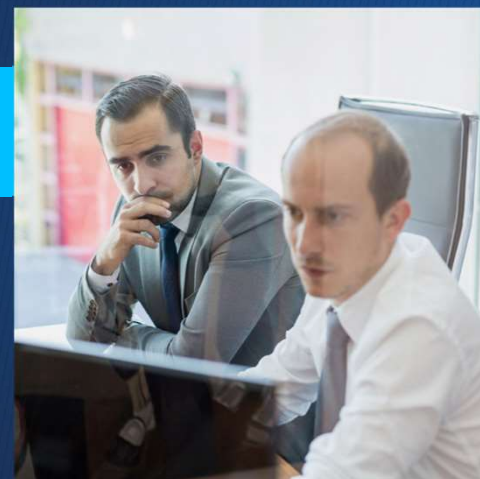
Skills & Resource Gaps