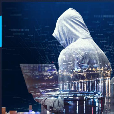
Sophisticated & Evolving Attacks